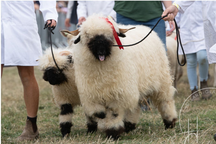
Above: Valais Blacknose breed Below: 2022 Champion Sheep